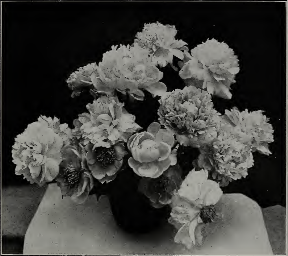
A Basket of Scarce, New Varieties